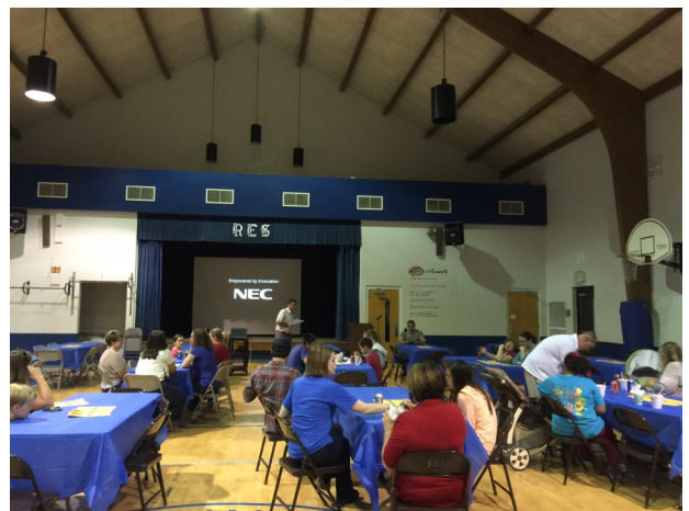
Title I Annual Meeting