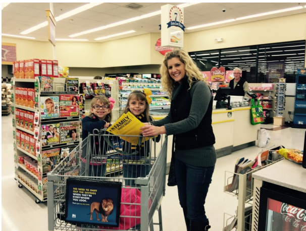
RES Math Night at Food Lion

Keep up to date with your child's standing in each class by 'registering for the Parent Portal and monitoring it .